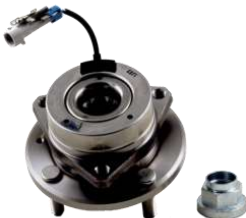
Ref. OE 96639585 R190.06

A visual inspection is required to determine which bearing should be fitted to the vehicle: the bearing with the metal cover corresponds to kit R190.06.