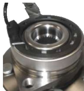
Ref. OE 96812719